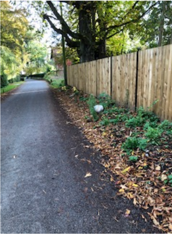
View of erected fence to the south.