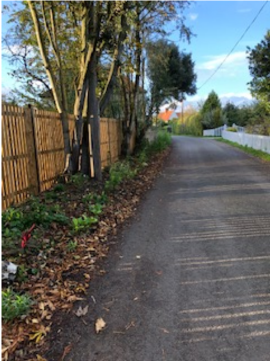
View of erected fence to the north.