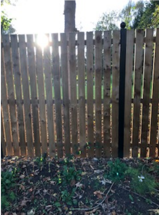
1.8 vertical timber panels.