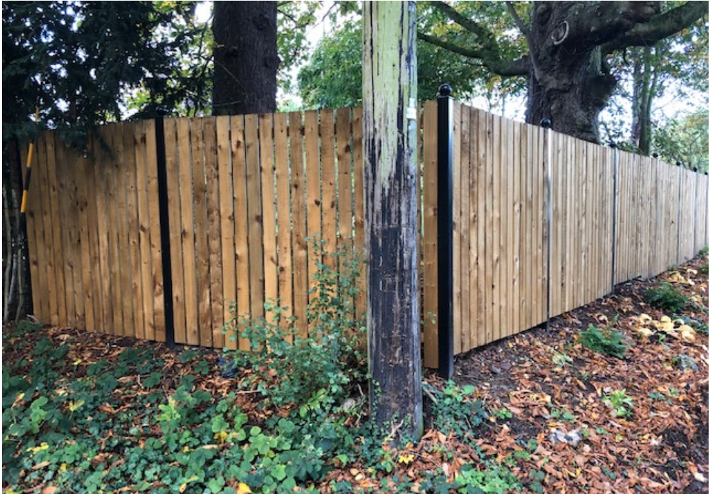
View of erected at the edge of land ownership.

Photographic survey for the retrospective application for erected 1.8m vertical timber panel fence with black painted metal posts. Replacing existing poor quality boundary treatment.