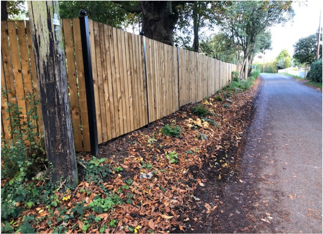
View of erected fence to the north.