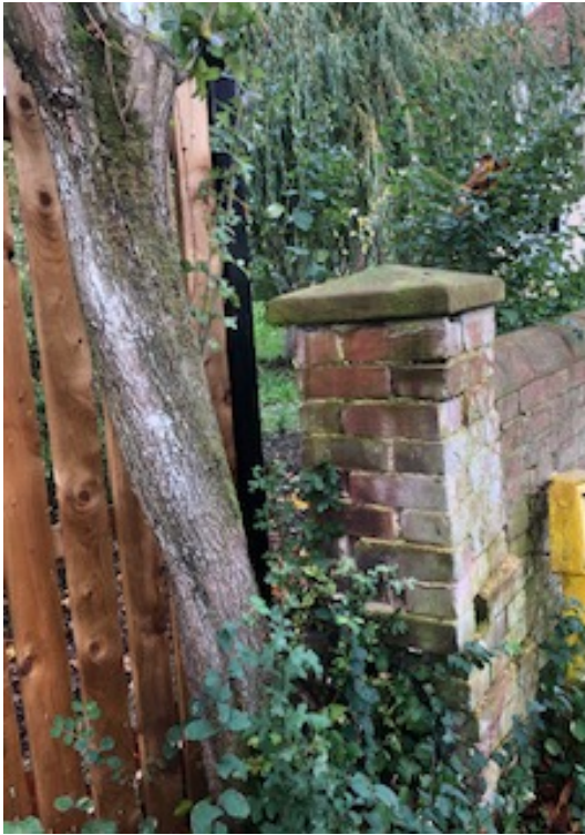
Fence erected set behind brick boundary wall.