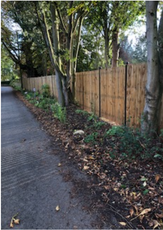
View of erected fence to the south.